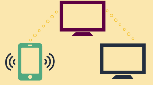
Different types of mediation — you don't have to be in the same room