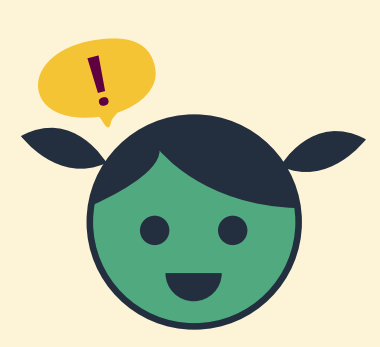
Everyone is heard. This can include your children.