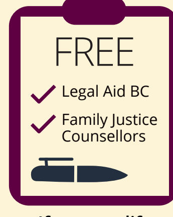
If you qualify