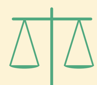
Mediators don't take sides

If you and your spouse or partner need help discussing and resolving issues, a mediator can help.